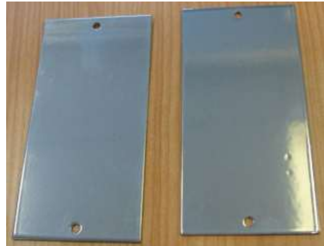
Exposed sample Reference Refrigerator (5°C – 41°F)