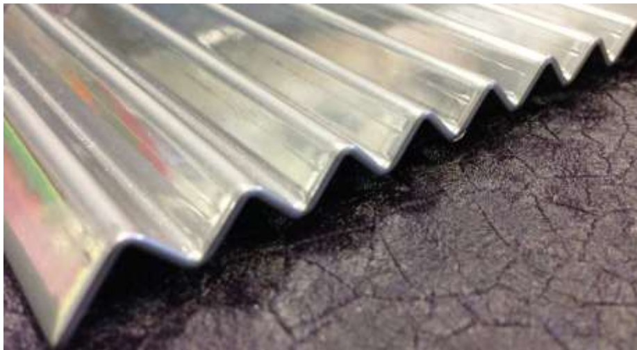
Aluminum panel, 1 mm thickness, coated with Steelook-001 powder then bended with die 6 mm and punch 0.8 mm.

The Steelook series represents an incomparable and really unique kind of powder coating: the metal effect that results from the application of this product permits to decor every object and surface for original and really outstanding solutions.