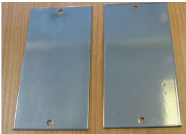
Exposed sample Reference Shaded outdoor