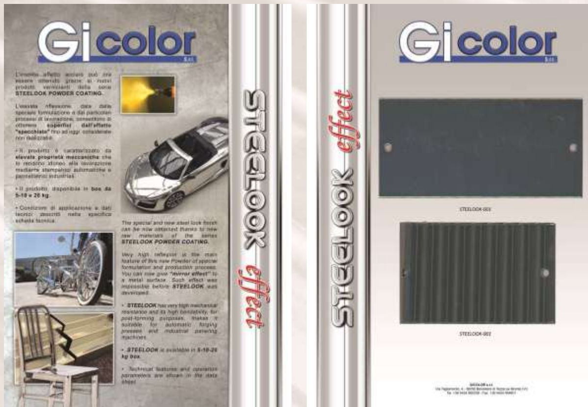
A4 catalogue with aluminum samples

P With each 20 kg product order will be delivered a copy FOR FREE of the A4 catalogue with aluminum samples.