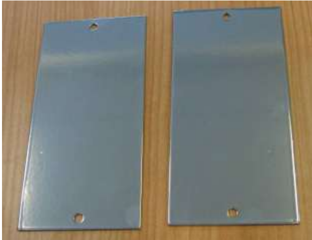
Exposed sample Reference Indoor