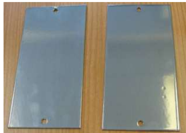
Exposed sample Reference Outdoor